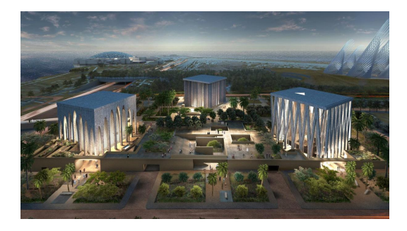
Abrahamic Family House Site Tour & Discussion Thursday, September 15, 12:30 PM – 1:30 PM

Notes & Highlights: Members of the delegation were moved by the unifying nature of the Abrahamic Family House, which creates a shared space and worship sites for the three Abrahamic religions. The two main takeaways from this visit are that The Church of Jesus Christ should get more involved as construction concludes and the site opens to the public, and that Utah could explore ways to incorporate this interfaith concept back home in our state.